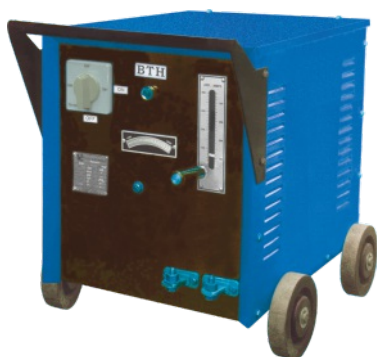
TRANSFORMERS 400 / 600 Amps