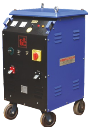
TRANSDUCTOR / THYRISTORISED ARC WELDING RECTIFIERS 300 / 400 / 600 Amps