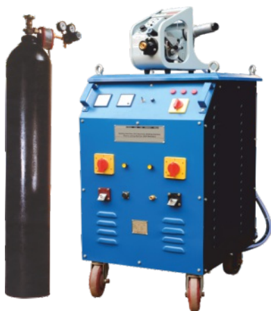
MIG MACHINES 300 / 400 / 600 Amps