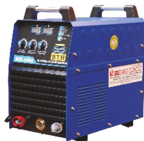
IGBT INVERTER MIG 400 / 600 Amps