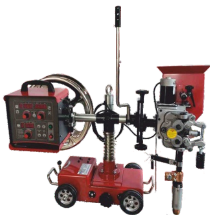
SUBMERGED ARC WELDING MACHINE 600 / 800 / 1000 / 1200 / 1500 Amps