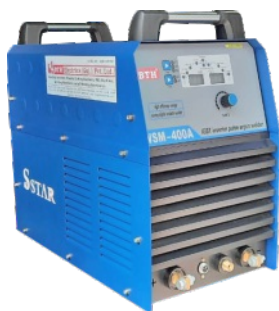
POWER 160 To 600 A IGBT Inverter Controlled STICK/TIG Welder with or without HF