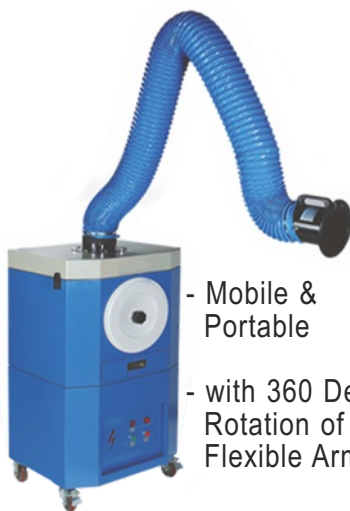
- Mobile & Portable - with 360 Deg. Rotation of Flexible Arm WELDING FUME EXTRACTION SYSTEMS