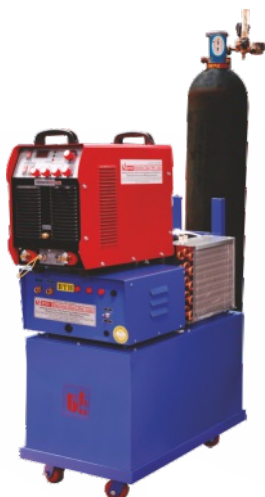
HIGH FREQUENCY WITH WATER COOLING UNIT