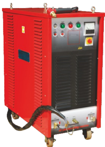
AIR PLASMA CUTTING MACHINE 2 mm TO 50 mm